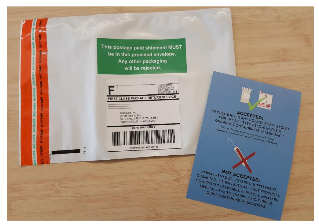
Photo 3. San Francisco residents can pick up prepaid medicine mail-back envelopes at mail-back distribution locations and disabled and home-bound residents can request them through MED-Project's website and phone number