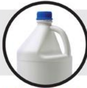
Chemicals & Cleaners