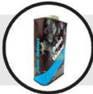
Thinners and Solvents