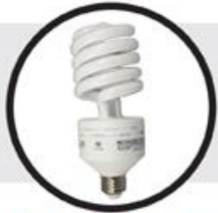
Fluorescent, HID and Neon Bulbs & Ballasts