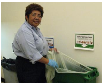
Day porter services compostables each afternoon so night janitors do not have extra work.

"Each tenant designated someone to serve on the building's 'Green Team'. SF Environment provided training and supplied tools such as posters, fliers, and stickers to support the program. Then they conducted follow-up training and audits to help make sure we were continuing to be successful."