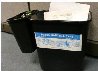
Trash bins were repurposed for recycling and hung with a small trash caddy.